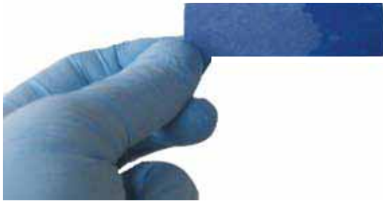
The Hydrocarbon Detection Strip turns a darker blue when hydrocarbons are present.