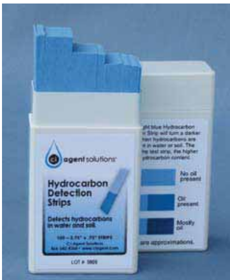
Hydrocarbon Detection Strips comes in a hard plastic container.